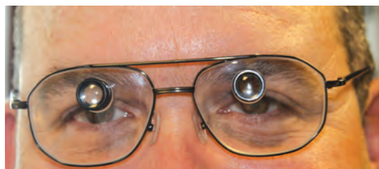
BITA Bioptic System

Our driving program is designed to assess for road readiness, identify risks and train qualifying individuals for returning to driving. Not everyone is a good candidate for the driving program. The standards set by the State for visual acuity and visual field have to be met in order to drive on the road.